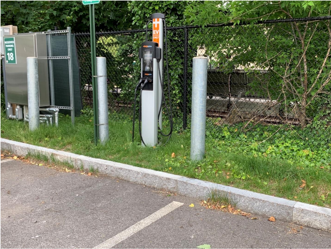
Parkway Road Lot (One Level-2 EV Stations)