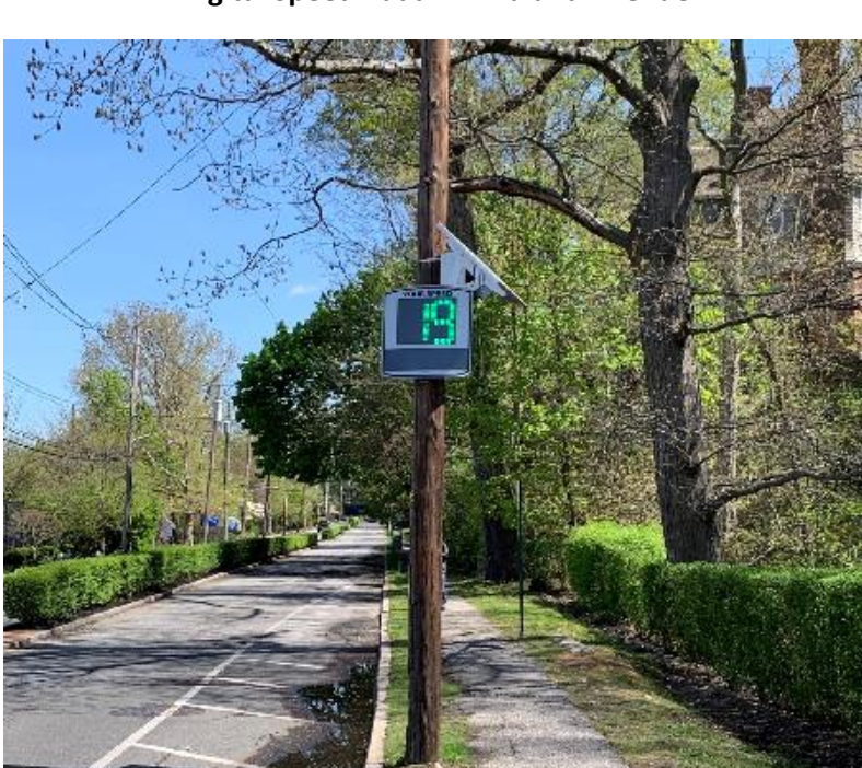
Digital Speed Radar – Midland Avenue

Supplementing these efforts, the Village also utilize several digital speed radars which are located on Midland Avenue and Pondfield Road. The Village has also installed Rapid Rectangular Flashing Beacons (RRFB's) at the crosswalks located by Bronxville Public Schools on Midland Avenue (installed August, 2020) and St. Joseph's School on Kraft Ave (installed May, 2020).