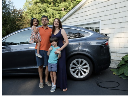
We created a free Clean Ride and Drive event showcasing electric vehicles, lawn equipment, and biking options for residents.