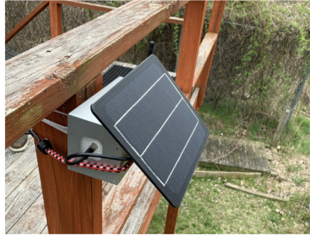
We installed air quality monitors at two train stations in Bedford, tracking air quality changes over time.