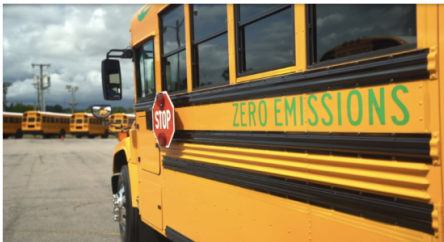
We are campaigning for adding electric school buses to the local fleet to protect the health and safety of our children.