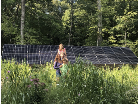
We helped over 200 community members save on electric bills and support clean energy in New York State by enrolling in the community solar program.