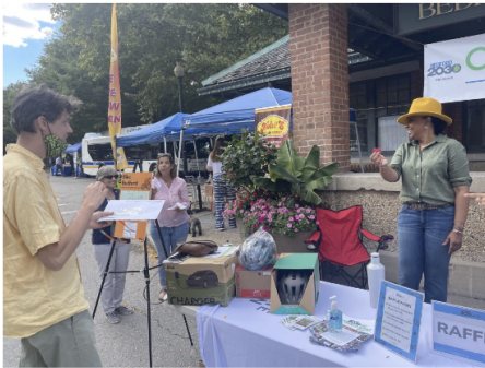
We designed a Bike Bedford map for Google, indicating speed limits and shoulder sides on throughways and important roads.