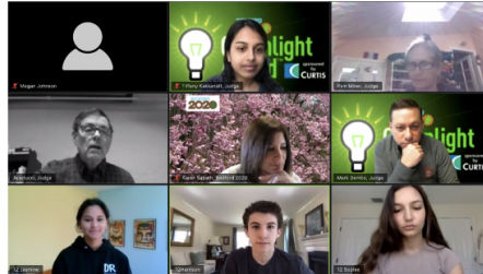
We host the annual Greenlight Awards, empowering hundreds of students to take climate action in their communities.

Link to the environmental Justice page of the bedford 2030 website: https://bedford2030.org/about/environmental-justice/