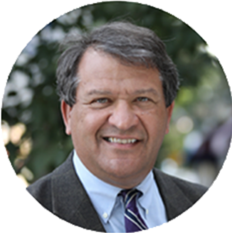
County Executive George Latimer Welcoming Remarks 9:30am