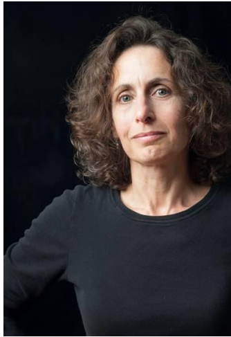
Elizabeth Kolbert, Writer

Elizabeth Kolbert is a staff writer for The New Yorker. She is the author of "Field Notes from a Catastrophe" and "The Sixth Extinction," which received the Pulitzer Prize for general nonfiction in 2015. She is a two-time National Magazine Award winner and a National Academies communications award.