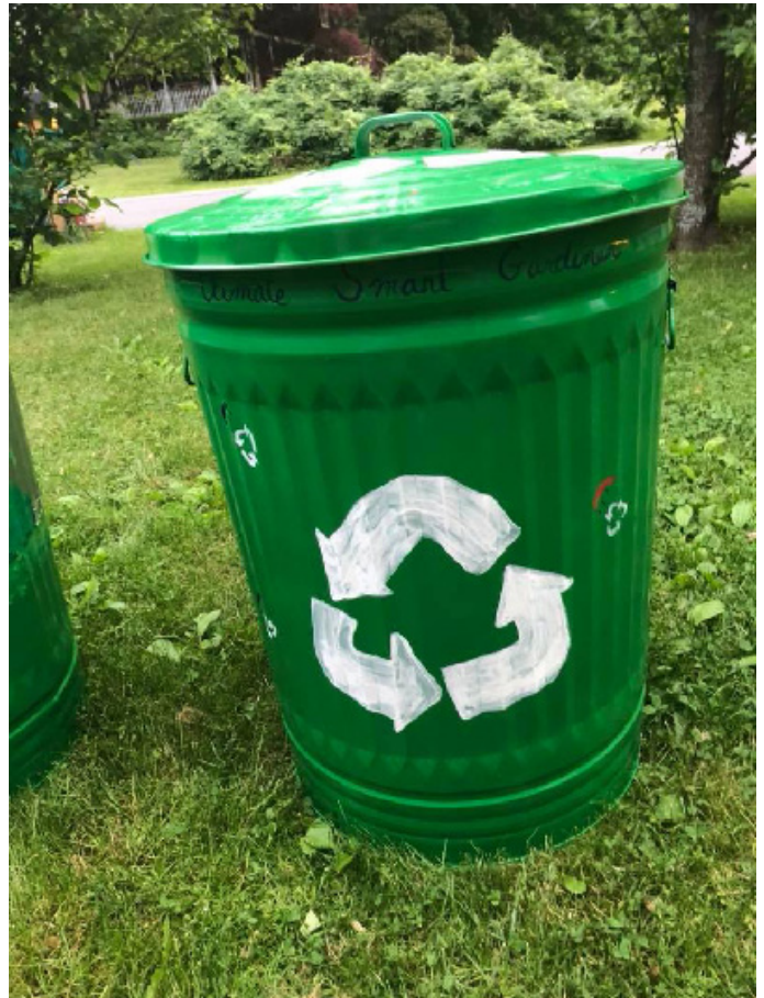
The cans were donated on behalf of the Climate Smart Gardiner Taskforce.