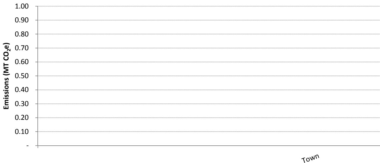
Emissions by Department