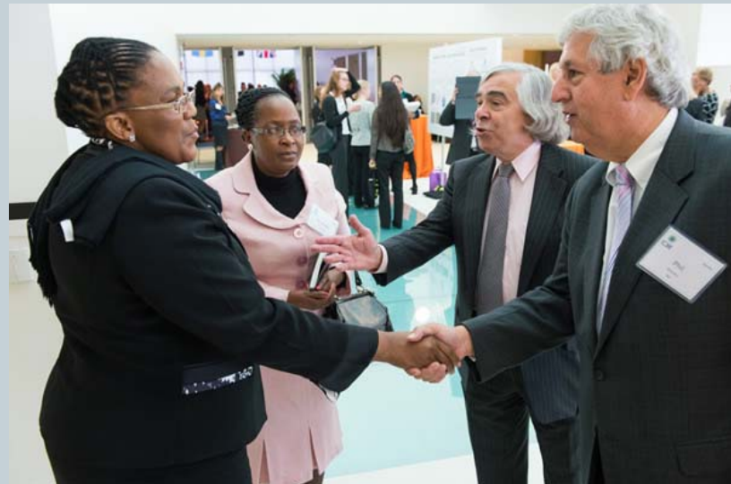
South African Energy Minister Dipuo Peters with U.S. Energy Secretary Ernest Moniz at the 2012 C3E Symposium