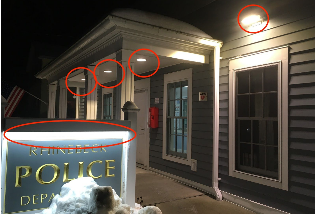
Police station showing 12 outdoor LED lights.