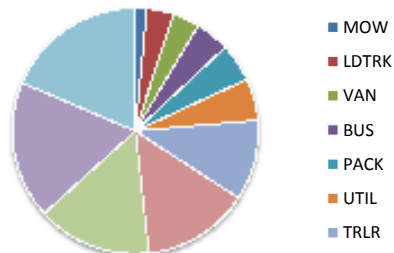
Vehicles by Type