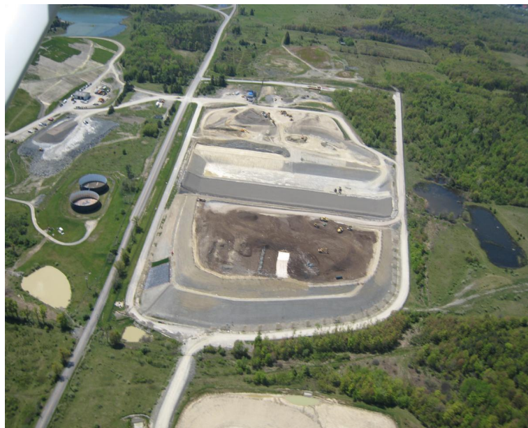
Aerial view of Section IV Cell 1, 2 & 3.