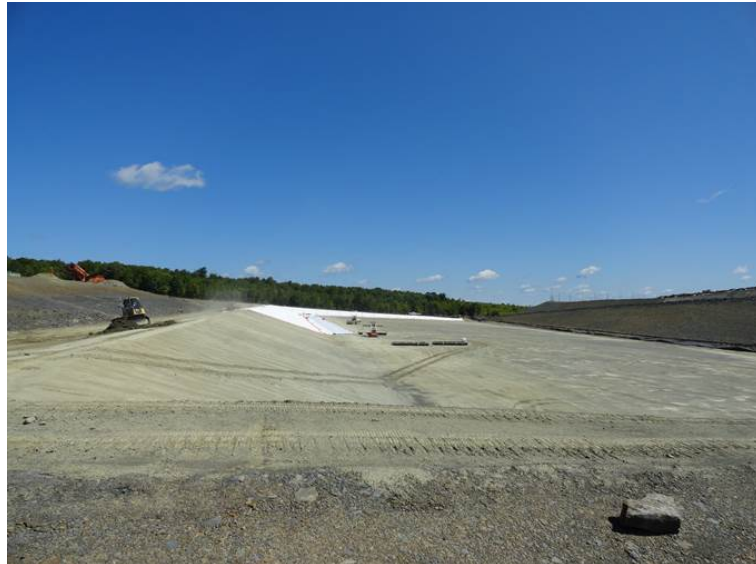
Cell 3: Crews installing the geomembrane layer of the landfill liner system.