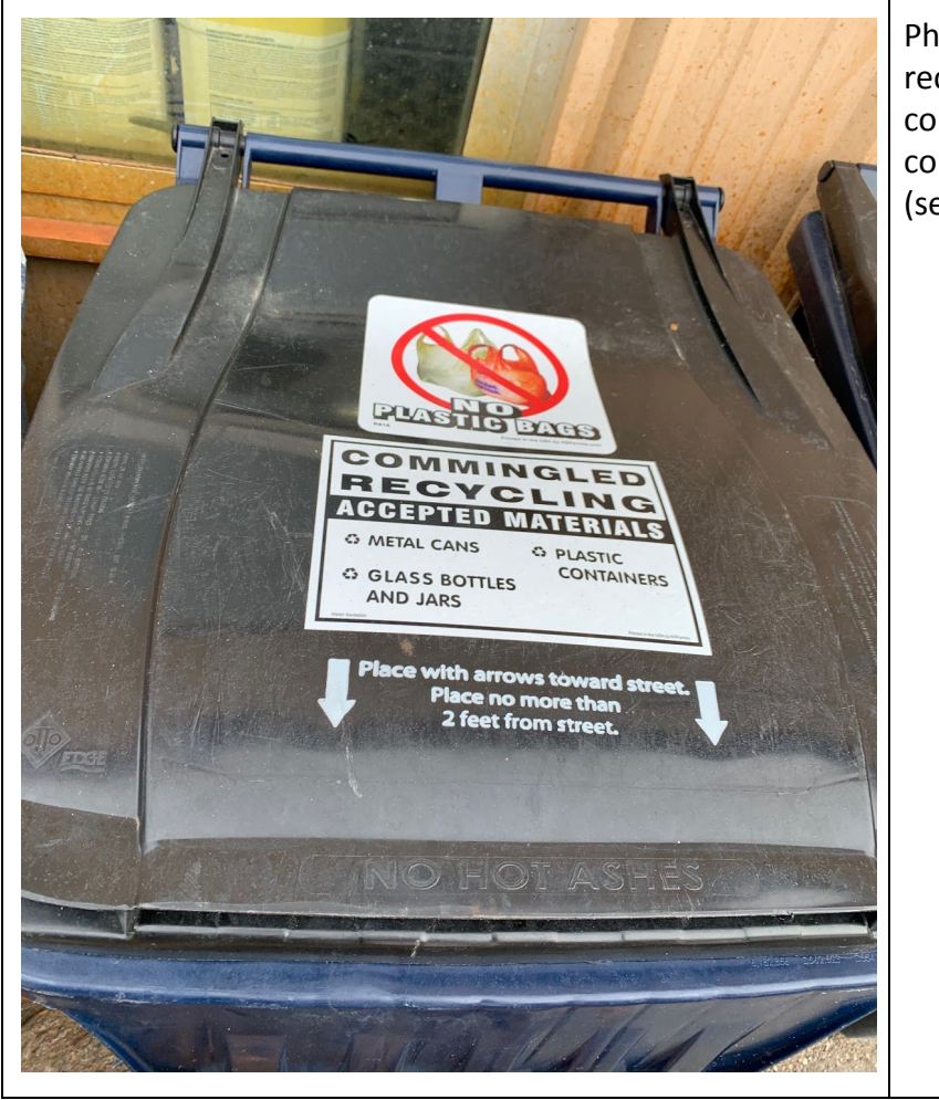
Photo showing one of the three recycling bins, this one for comingled bottles, cans, plastic containers at the Waste Water (sewage) Treatment Plant.