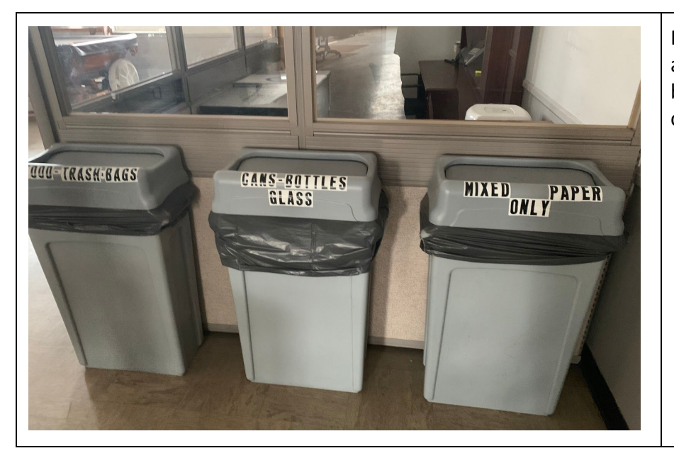
Photo showing the additional recycling bins, along with the one for trash.

Village Hall purchased two recycling containers to encourage staff to recycle and sort bottles, papers, garbage, etc into their specific containers. The recycling containers are located on the first and second floor of the building. Additionally, a larger commercial recycling container replaced the small recycling container for weekly commercial recycling pick up by our contracted recycling company. Shredded paper will be collected separately and donated to the SPCA for bedding. Bottles are collected and donated to various organizations that the Village staff supports.