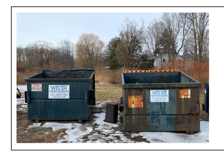
Photo of the dumpsters at the Highway Department where public "Big Belly" recycling is gathered.

Highway Department (rte 308 garage) has a commercial recycling container and a garbage container that is used by them and for public materials picked up in the Village (see our documentation of the "Bilg Belly" recepticals for public recycling). The Highway Dept. empties the the Big-Belly Trash and recycling containers in the Village every Monday and Friday and separates the collection into the appropriate commercial bins at the Highway Department garage.