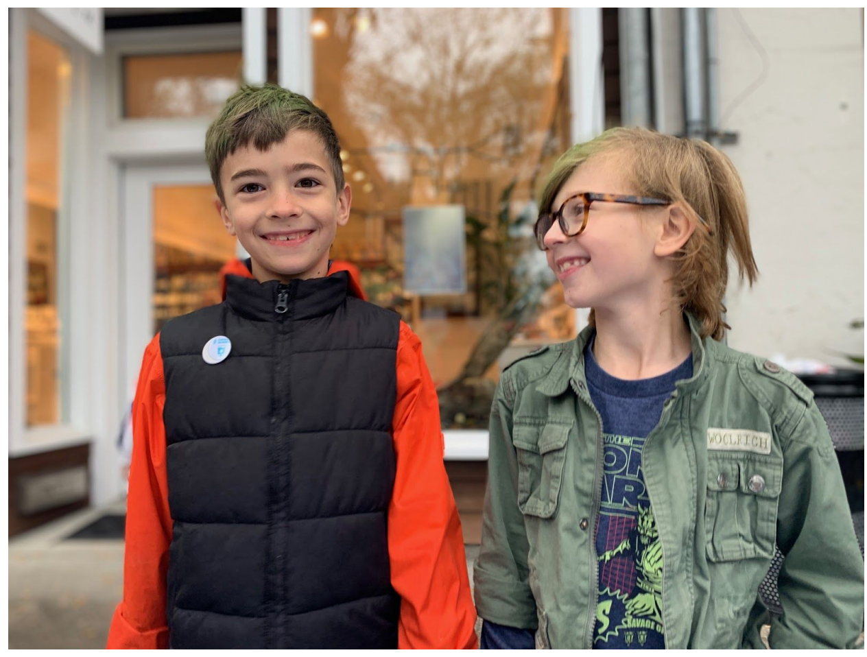
"Attend the family-friendly, free Clean Power Expo featuring Green exhibitors, EV test drives & Activities. Start at Town Hall and get a free Clean Power Guide. Then grab an Action Checklist and a Village Map and 'Walk the Talk'. Participating local businesses and volunteers, presenting actionable tips and tricks to green your life."