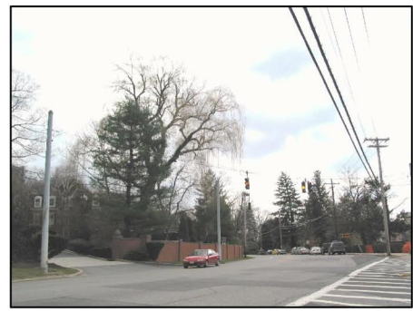
Broadway & Livingston Ave.