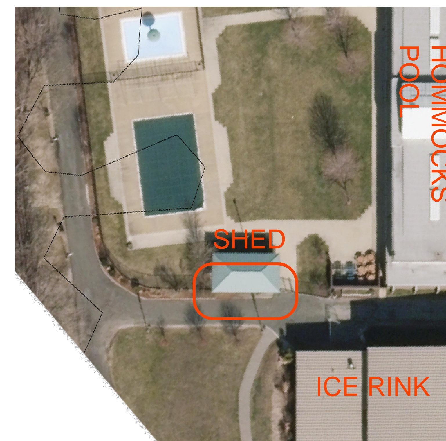
1 LOCATION PLAN

Revision/Date: Description: Issue to: Drawing Title: