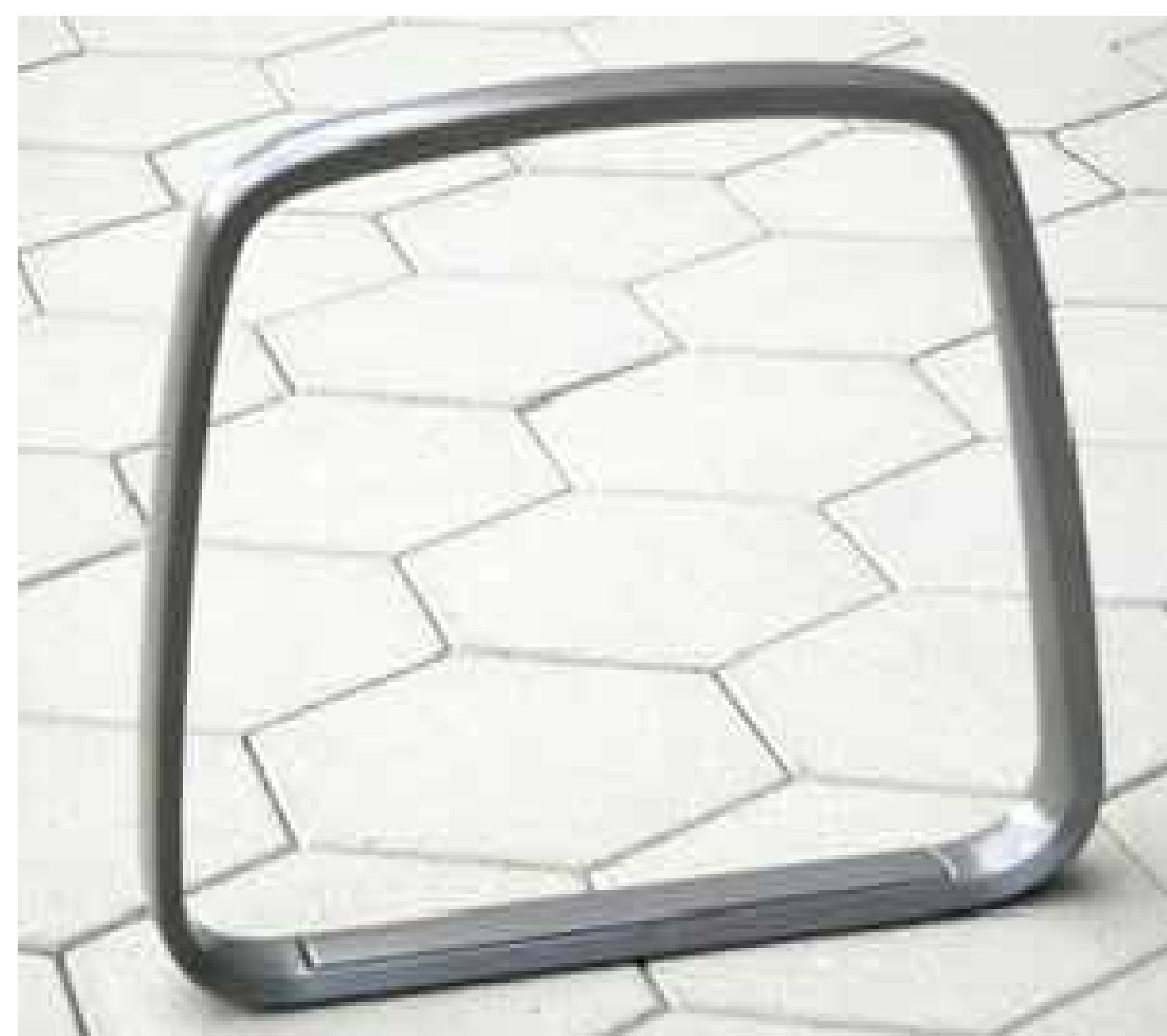
3 BIKE RACK - TYPE LANDSCAPEFORMS - "METRO 40 RIDE"