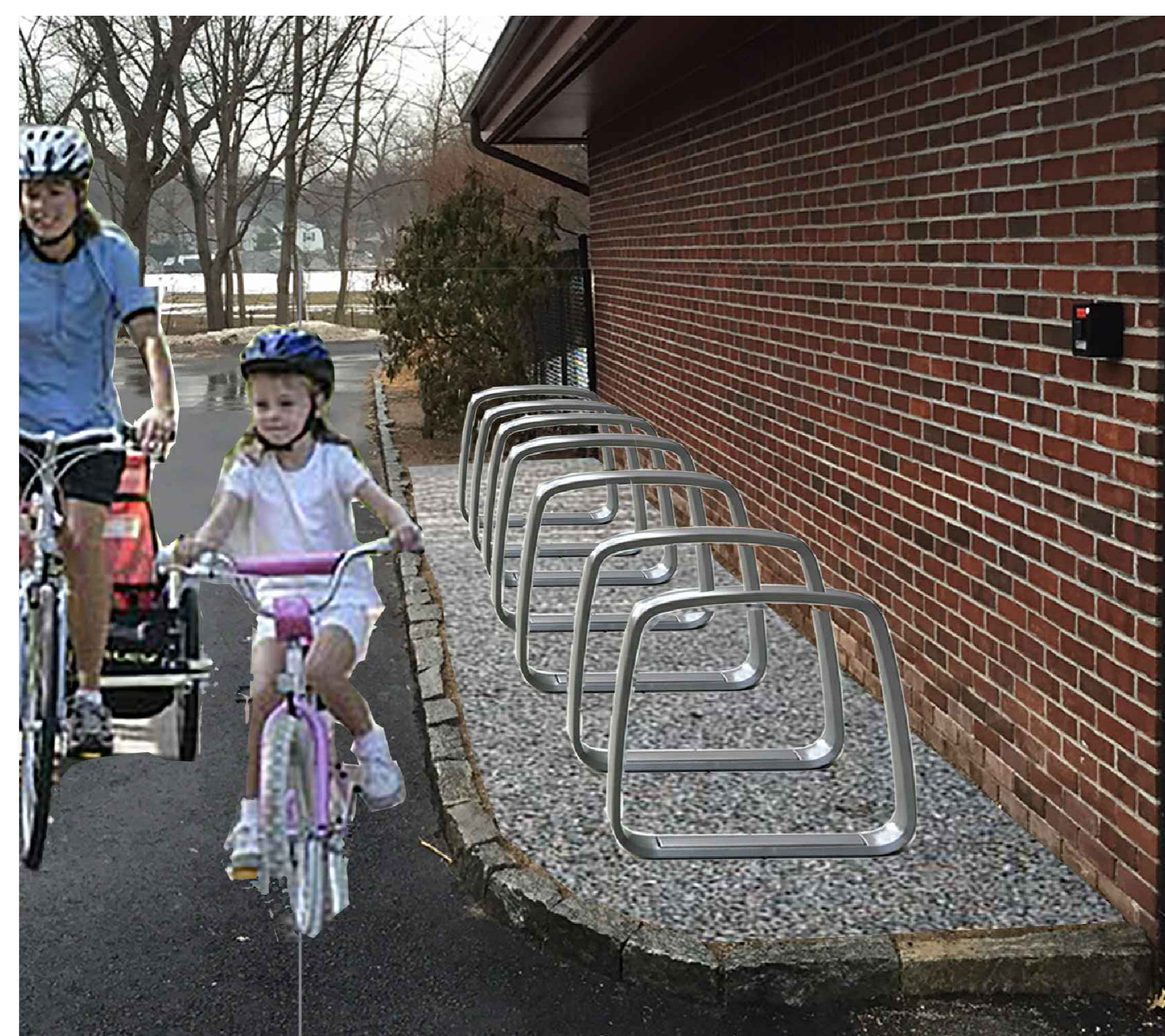
3 BIKE RACK - VIEW LANDSCAPEFORMS - "METRO 40 RIDE"